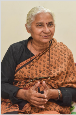
Medha Patkar (Mumbai 1954)