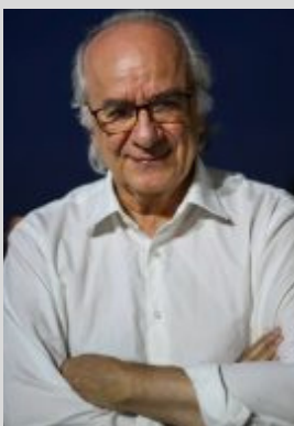
Boaventura De Sousa Santos (Coimbra 1940)