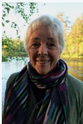
Grazia Francescato (Paruzzaro 1946)

Graduated in foreign languages and literature, politics, journalist and environmentalist. In 1973 she was one of the founders of "Effe", the first feminist magazine in Italy, which she also directed from 1976 to 1978. Editor of the ANSA news agency since 1977, also as correspondent from Brussels, she collaborated with Globe, Panorama, The Republic, Nature Today, Oasis and The New Ecology. She was a correspondent from Rome for the magazine Irone. In 1990 she conducted the television program Geo. Elected to the National Council of the WWF in 1986 and a candidate for the Greens in Naples the following year, since 1989 she has directed the WWF monthly "Panda". In the same year she was again a candidate with the Greens for the European elections. President of WWF Italy from 1992 to 1998, in 1994 she also joined the international WWF Council. From May 2003 to May 2006, was elected Female Spokesperson of the European Greens. From July 2003 to February 2006 she was Municipal Councilor of Villa San Giovanni (Calabria). She was elected Deputy of the Italian Parliament in April 2006. Grazia Francescato has published several books, including "Poisoned Planet" (La Nuova Italia, 1977).