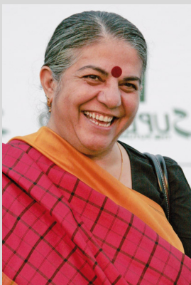
Vandana Shiva (Dehradun, India 1952)

Environmentalism and theorist of overcoming the logic of development, he is a social scientist who worked for many years at the Wuppertal Institute for climate, environment and energy. For 9 years he was President of Greenpeace Germany and taught at Schumacher College and the University of Kassel. He has published numerous essays on the theme of the environment and social justice, on the limits of globalization and on the contemporary economy. In Italy, the following have already been published, among others: Environment and social justice. The limits of globalization (2001), For a fair future. Resource conflicts and global justice (2007) and Sustainable future: eco-social responses to the crisis in Europe (2011).