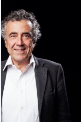
Fabrizio Barca (Turin 1954)