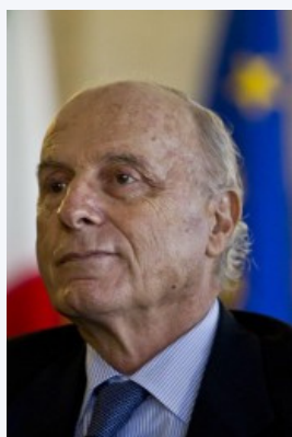
Paolo Maddalena (Naples 1936)

Graduated in foreign languages and literature, politics, journalist and environmentalist. In 1973 she was one of the founders of "Effe", the first feminist magazine in Italy, which she also directed from 1976 to 1978. Editor of the ANSA news agency since 1977, also as correspondent from Brussels, she collaborated with Globe, Panorama, The Republic, Nature Today, Oasis and The New Ecology. She was a correspondent from Rome for the magazine Irone. In 1990 she conducted the television program Geo. Elected to the National Council of the WWF in 1986 and a candidate for the Greens in Naples the following year, since 1989 she has directed the WWF monthly "Panda". In the same year she was again a candidate with the Greens for the European elections. President of WWF Italy from 1992 to 1998, in 1994 she also joined the international WWF Council. From May 2003 to May 2006, was elected Female Spokesperson of the European Greens. From July 2003 to February 2006 she was Municipal Councilor of Villa San Giovanni (Calabria). She was elected Deputy of the Italian Parliament in April 2006. Grazia Francescato has published several books, including "Poisoned Planet" (La Nuova Italia, 1977).