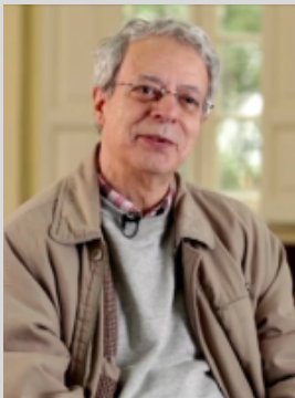
Frei Betto (Belo Horizonte, 1944)

Carlos Alberto Libânio Christo, known as Frei Betto is a Brazilian theologian and one of the leading exponents of liberation theology. Priest of the Dominican Order. Progressive writer who supported liberation movements in Latin America. He has, among other awards, the Juca Pato Prize for his book Fidel y la Religion ; the Medal of Solidarity, from the Government of Cuba; the Paulo Freire Trophy of Social Commitment (2000), the recognition of the Brazilian Psychological Councils and the ALBA Award for Letters in recognition of his literary work as a whole. Among his numerous writings we find: That man called Jesus (EMI, 201), There is no progress without happiness (Rizzoli, 2004), Mysticism and spirituality with Leonardo Boff (Cittadella, 1995) and Prayer in action. Contribution to a spirituality of liberation (EDB, 1980).